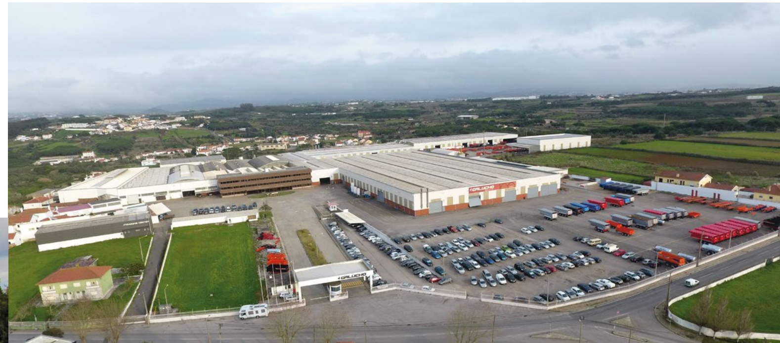
Galucho headquarters São João das Lampas | Sintra | Portugal

With more than 100 years of activity, Galucho is currently specialized in the manufacture of equipment for agriculture and for the industrial transport. Has production centers in Portugal (São João das Lampas and Albergaria) and some strategic partners for the distribution of equipment in international markets, having exported throughout its history to more than 100 countries.