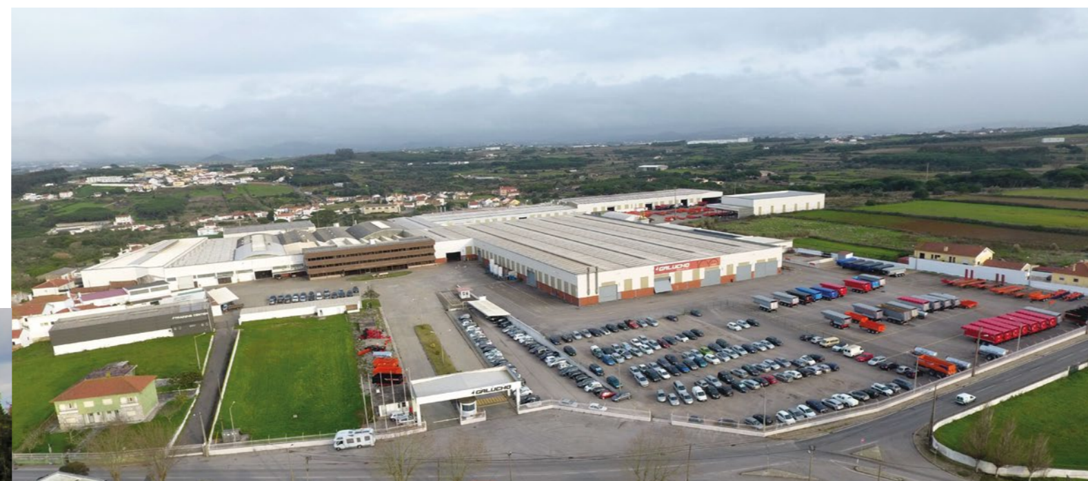
Galucho headquarters São João das Lampas | Sintra | Portugal

With more than 100 years of activity, Galucho is currently specialized in the manufacture of equipment for agriculture and for the industrial transport. Has production centers in Portugal (São João das Lampas and Albergaria) and some strategic partners for the distribution of equipment in international markets, having exported throughout its history to more than 100 countries.